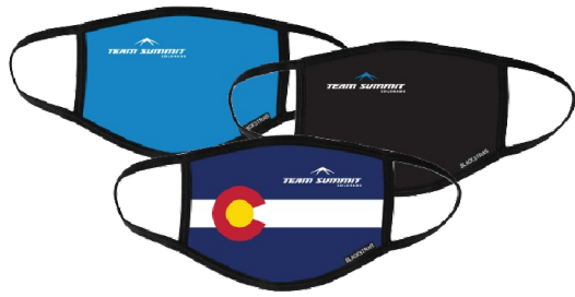
THE BLACKSTRAP CIVIL MASK