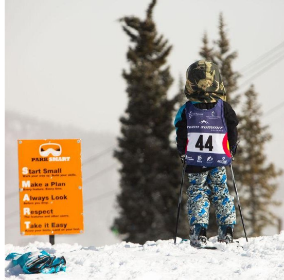
Photos from the Summit Foundation Cup at Copper Mountain