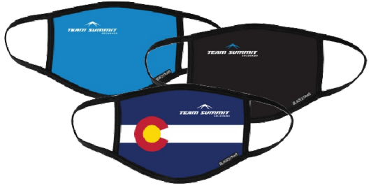
THE BLACKSTRAP CIVIL MASK