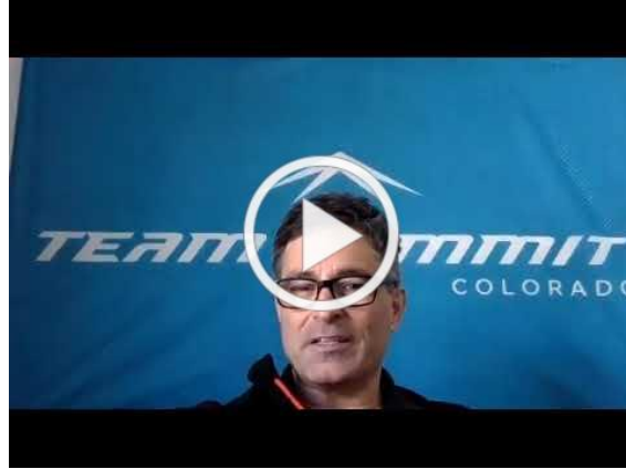
Address from the Executive Director