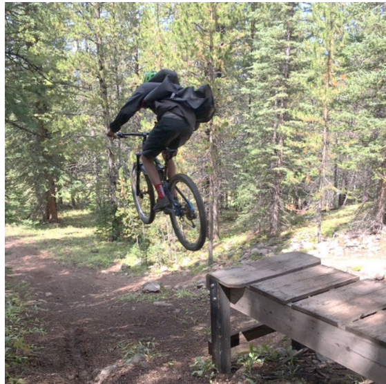
Registration is open for Camps, Summer, Biking and more!