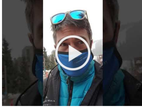
Address from the Executive Director