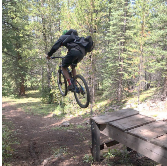
Registration is open for Camps, Summer, Biking and more!