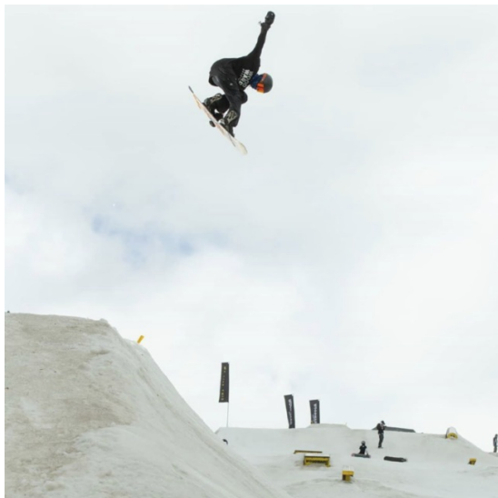
Freeski Spring and Summer Camps are Open - Register Now!