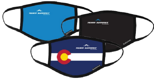
THE BLACKSTRAP CIVIL MASK