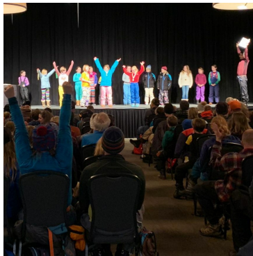
The Summit Foundation Cup at Keystone - GS and SL