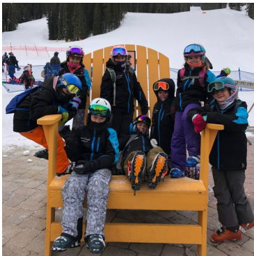
ITS straight chillin'