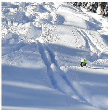
Intro to Team Summit gets deep this past week