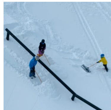
P&P crew helps Keystone's A51 Crew get the park open