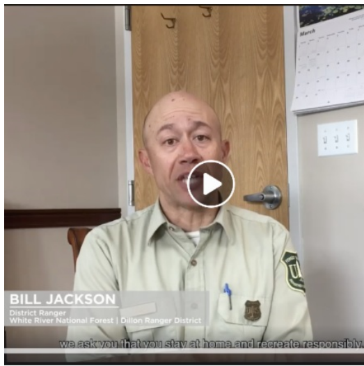
A great message from our partners!