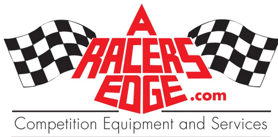
A letter from one of our partners