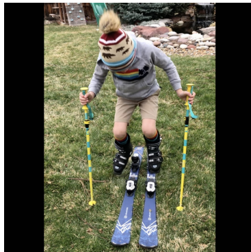
Still practicing our steeze... [click for the video]