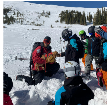
FS Devo Avalanche Awareness Recap