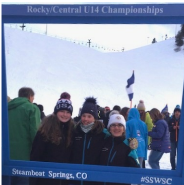
Alpine's U14 Championship in Steamboat Recap