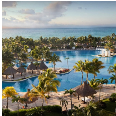
We've entered a Trip to Mexico into Love The Summit Auction (valid for 2 years) Purchase the Trip Here See Additional Items