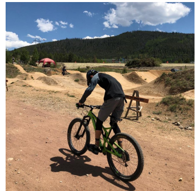
Mountain Biking is off to a great start!