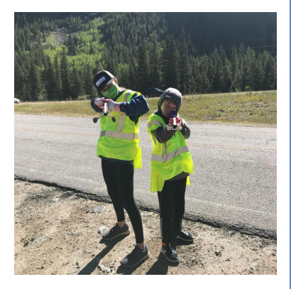
"Trash Hunters" at the off ramp at the Highway Cleanup on Sunday