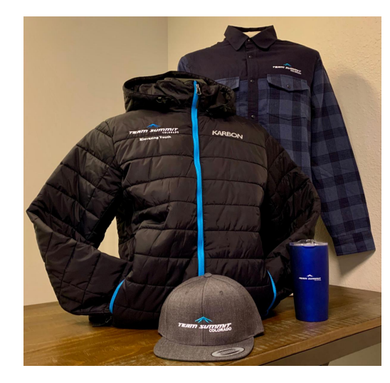
Team Summit has a new online store for Logo Wear and Wishlist Items