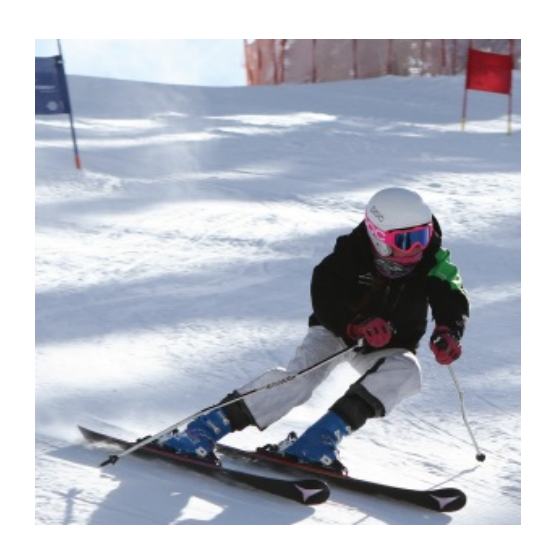
Aldo Radamus has a four part series in SkiRacing.com