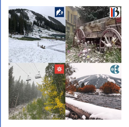
Snow in September... Are you as excited as we are?!

Email events@teamsummit.org for more information or to volunteer